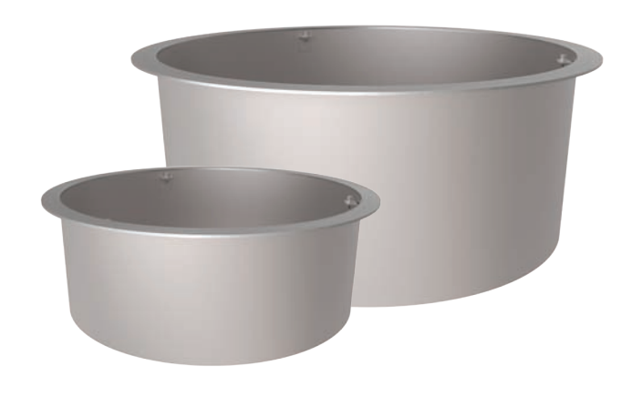
Not available in USA & Canada